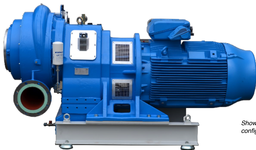
Shown with D-flange motor configuration and console