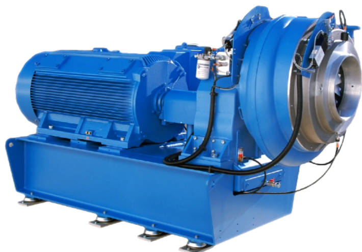
Shown with foot-mounted motor configuration